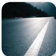
Road of the year 2015