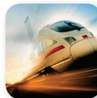
Transport Finance House of the year 2015