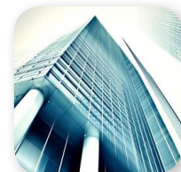
Best Financing House Award for the French Large Cap LBOs 2015